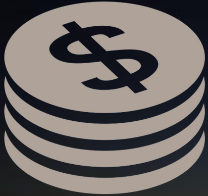
ELON MUSK'S ECOSYSTEM RESOURCES